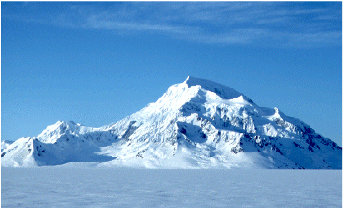
Mt Seattle from the N